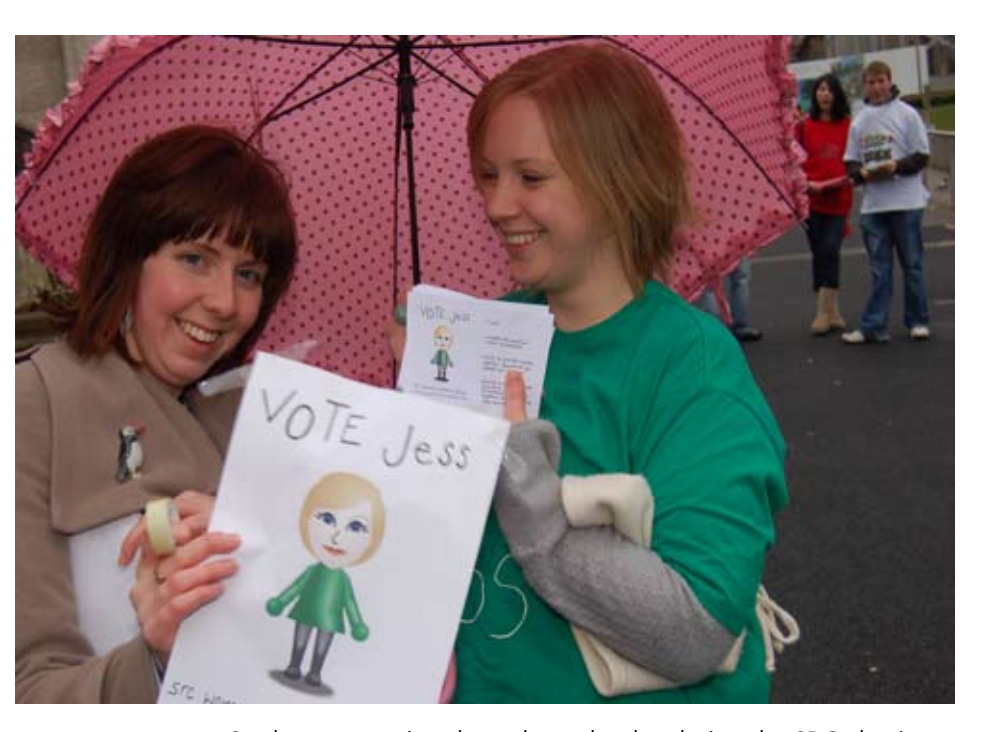
Students campaign throughout the day during the SRC elections.

As a representative organisation GUSRC recognise the importance of building a strong democratic base. They are slowly but surely increasing the numbers involved in their elections. The recent trend of increasing numbers voting in GUSRC Spring Elections continued, with 1733 votes cast against 1664 the previous year. Particularly promising was the high number of contested seats with thirtynine candidates standing for fourteen seats, four being uncontested. Over 100 people attended the Heckling Meeting, which is the highest attendance in many years. In addition, the Autumn Elections saw the highest turnout since 1995, a result of increased publicity and a strong group of enthusiastic candidates campaigning for votes.