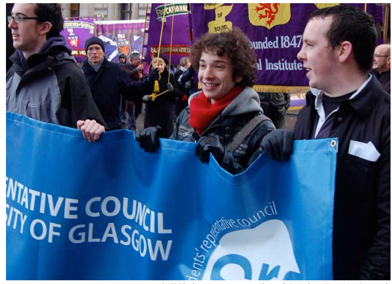
GUSRC had a strong presence at Glasgow's St. Andrews Day anti racism march.

GUSRC have also had ongoing dialogue with the Scottish government on proposed planning legislation relating to HMOs. Scottish Planning Policy SPP3: Along with written comments, GUSRC was invited to participate in a government organised event during March, aimed at involving key stakeholders in a discussion around the HMO proposals in the consultative draft of SPP3.