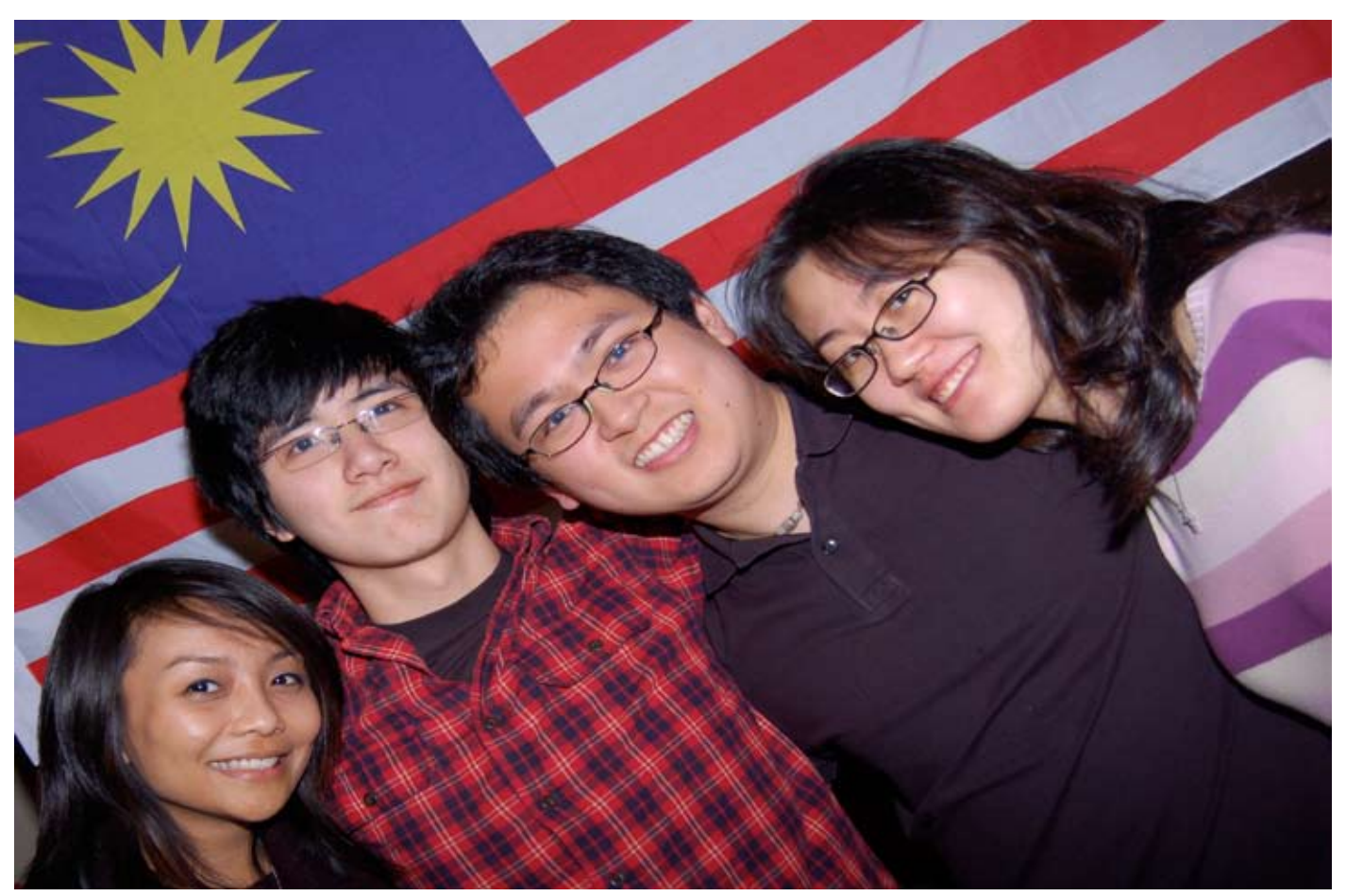
Students enjoying Global Village: a night celebrating cultures from around the world.

'It was one of, if not the, best week of my life!!! I had a fab time! Thank you so much!'