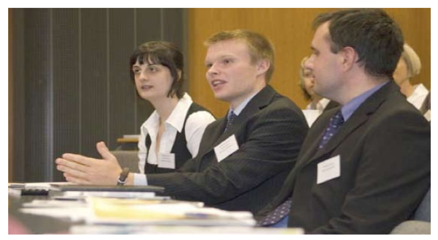
Through find a solution, students get to develop their skills and help local charities.

GUSRC also worked with the Community Council, Glasgow City Council and Ward Councillors on matters that can have a serious impact on the community in general and the student population in particular. The poor management of Houses in Multiple Occupation (HMOs) and the subsequent social, environmental and general 'quality of life issues' has provided common ground for all local partners to work together. GUSRC is represented on Glasgow City Council's HMO working group and therefore enjoys the opportunity of providing a student perspective on how the Council can help us overcome the difficulties and dangers experienced by students living in below standard accommodation.