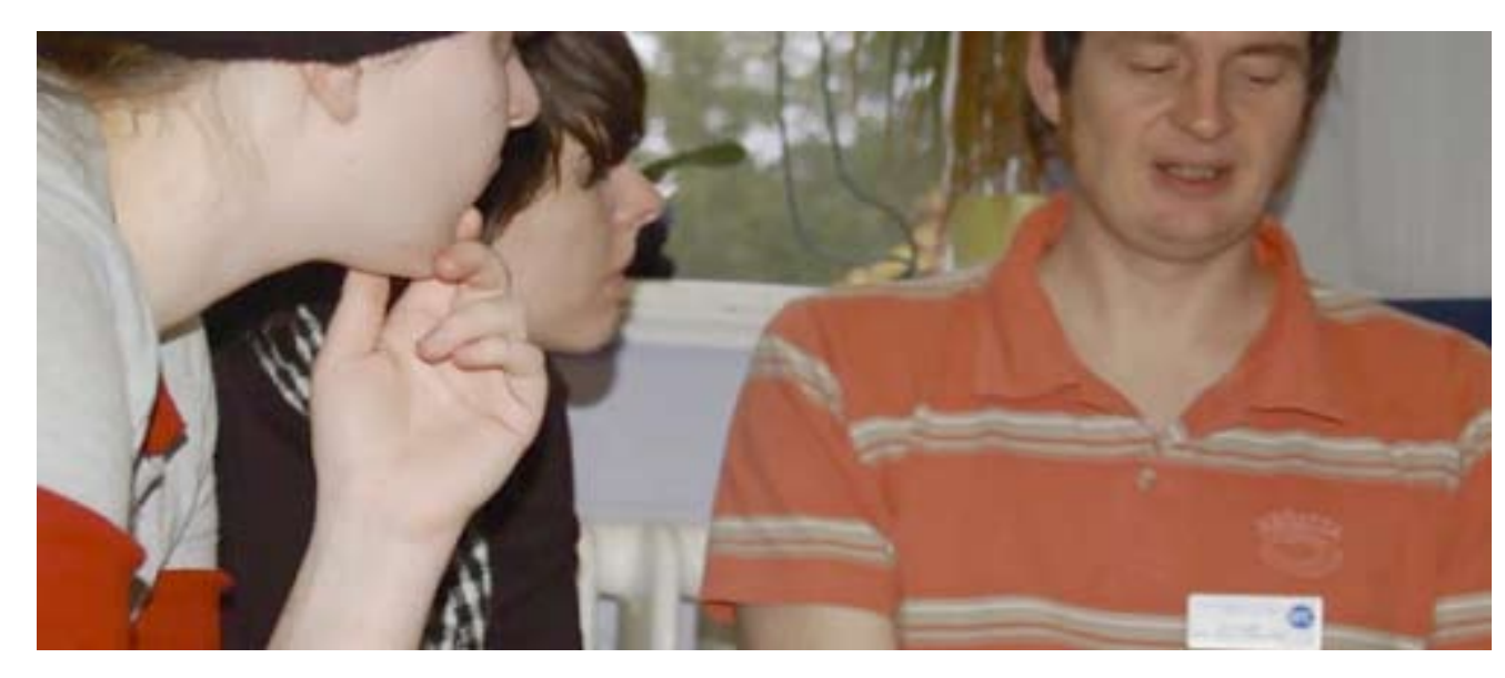
Some of the many students to get help from the advice centre this year.

Student E had had her course terminated by a Progress Committee which had not taken into account all the relevant facts. The advice centre was able to assist E to put together a letter of appeal and accompany her to the Faculty Appeals Committee hearing to help her put her case forward. E's appeal was upheld and she was allowed to return and finish off her course.