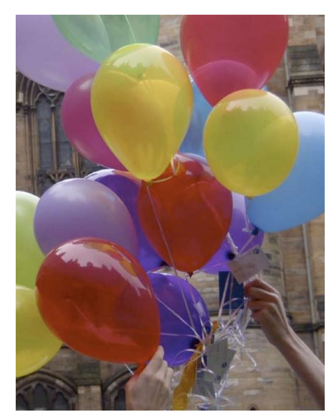
Raise and Giving Week kicked off with a balloon release.

Glasgow University Students' Representative Council is an independent, student-led organisation, recognised as the representative body for students registered at the University of Glasgow.